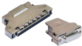
Connectors & Backshells

We provide a full range of supporting cable and connector solutions for all our switching products—20 connector families with 1200+ products. We offer everything from simple mating connectors to complex cables assemblies and terminal blocks. All assemblies are manufactured by Pickering and are guaranteed to mechanically and electrically mate to our modules.