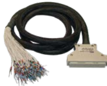
Multiway Cable Assemblies